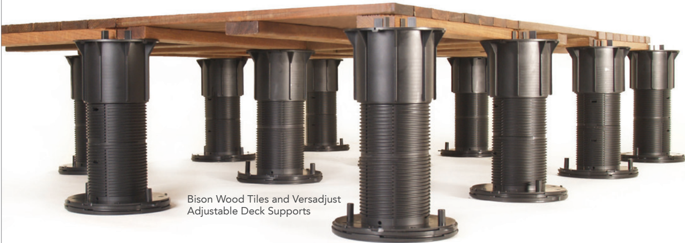
Bison Wood Tiles and Versadjust Adjustable Deck Supports